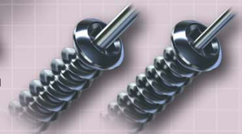
Zimmer 4.0mm Screw